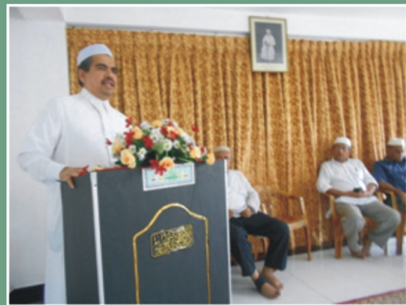
Arabic College, Beruwela