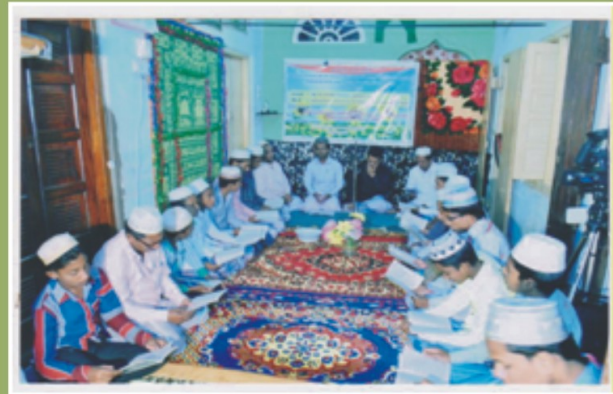
Mowlud being recited at Hiluriya Cultural Centre, Kattankudy