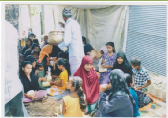
Distribution of food