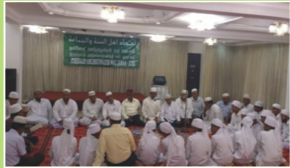
Meelad celebrations at Shahrn Banquet Hall, Dehiwela