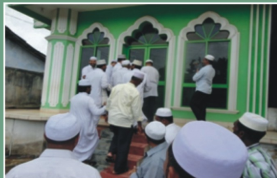
Opening of Zavya in Dickwella