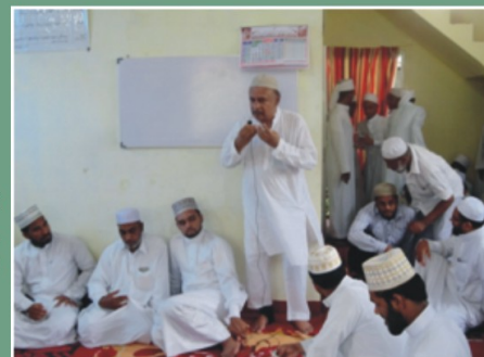
President at Ladies Arabic College, Matara