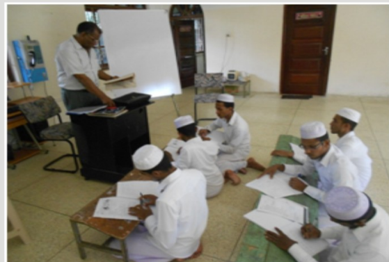
Below - Classes at Ghouziya Madrasa

A program to teach budding Moulavis to speak in English was started by the Association. The first madrasa to start Spoken English Classes was Ghouziya Madrasa, Hill Street, Dehiwela. Classes are conducted (twice a week) and these students will complete their course in May-June this year. The classes are conducted by a qualified, reputed Teacher.