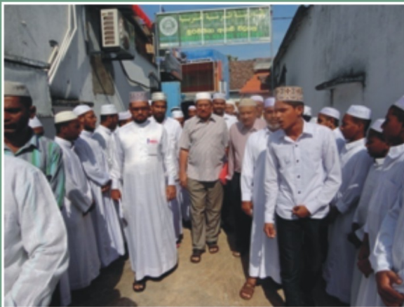
Welcome at Weligama