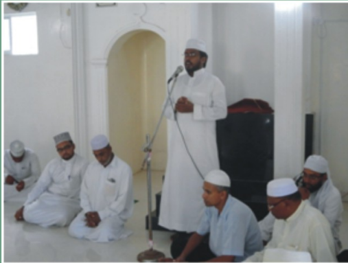
Bayan at Nalagama