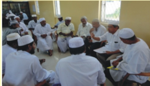
Meeting with Ahlussunnah Wal- Jamaah Theologians