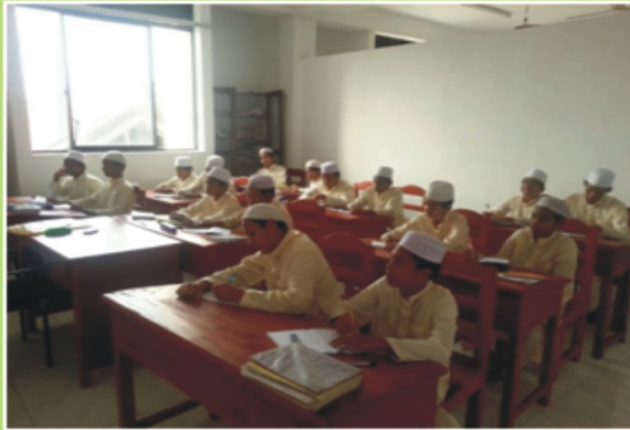
English classes at Beruwela

Following this, we received request from two other Madrasas namely the Arabic College in Beruwela and the Al Madrasa at Ummu Zavaya, Colombo. Part of the cost incurred for the teachers are borne by the Association.