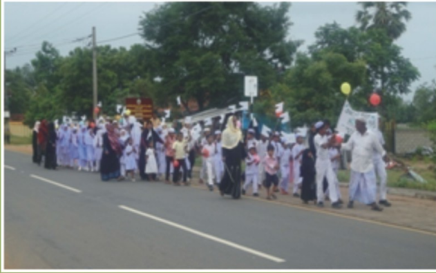
Children participating at Meelad celebrations at Madeena Masjid, Vallaichennai