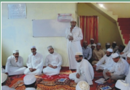
Bayan at Ladies Arabic College, Matara